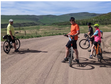
Gravel Road Bikers