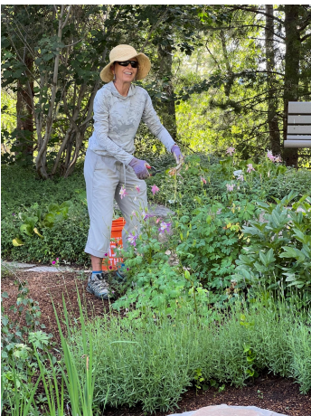
“A garden for all seasons”