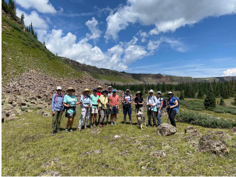
Hiking - Stillwater Reservoir