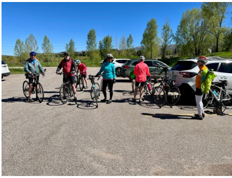
Road Biking Getting Started at River Creek Park