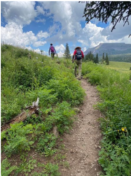
Mosquito Lake hike in the Flat Tops