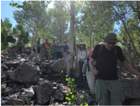
Windy Ridge Hike