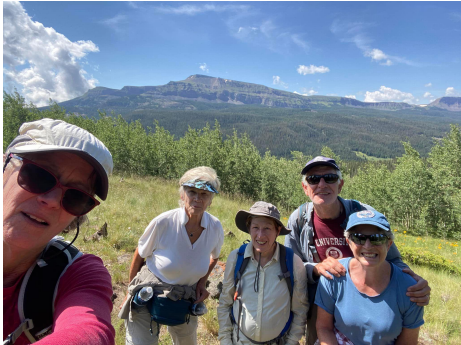
Mandell Lake Hike