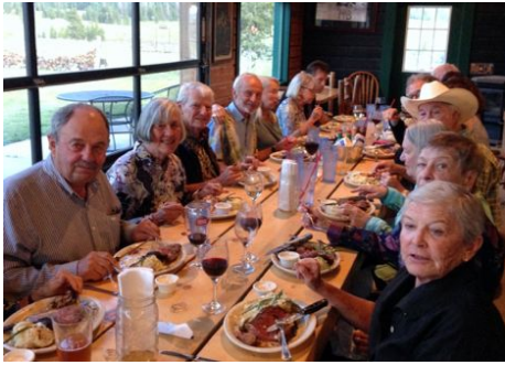
OTHG dinner at Hahn's Peak Roadhouse