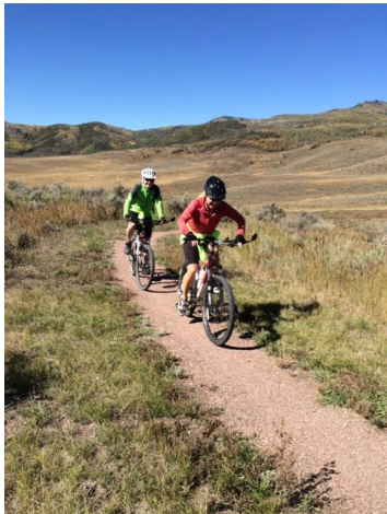
Biking at Stagecoach